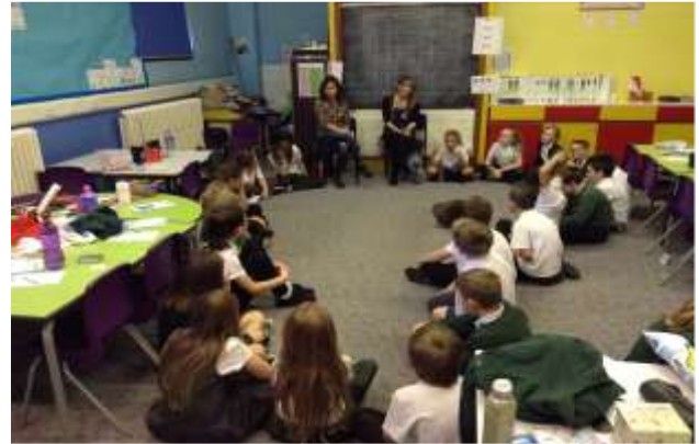
Photos show class P5R learning some new skills from our two Feis Rois visitors.