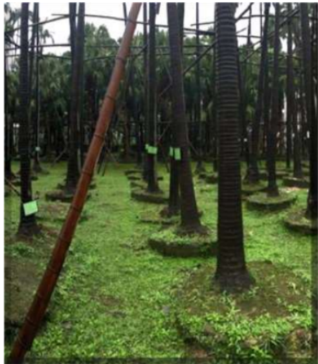
Pictured: An urban forest in Downtown Taipai, Taiwan

Hundreds of tiny forests the size of a school playground are springing up in towns and cities all around the world. Using a method first created in Japan, the soil is prepared with nutrients and native trees are planted close together to produce a rich, dense forest in only a few years. Described as 'resilient bubbles of nature', they create a small ecosystem, an environment where lots of different plants and animals can live together and thrive. Dutchman, Daan Bleichrodt, from Tiny Forest IVN said, 'We're densely populated in Holland, but every neighbourhood has about 200 square metres of barren land that can be converted into a natural forest.' The British government has allocated funding for twelve mini forests to be built in the UK, but will this be enough to affect climate change? Daan replied that thousands of square metres would be needed to make any real change. However, he was confident that it would benefit the world in a different way. 'We can educate a generation of kids to learn how to restore forests,' he said.