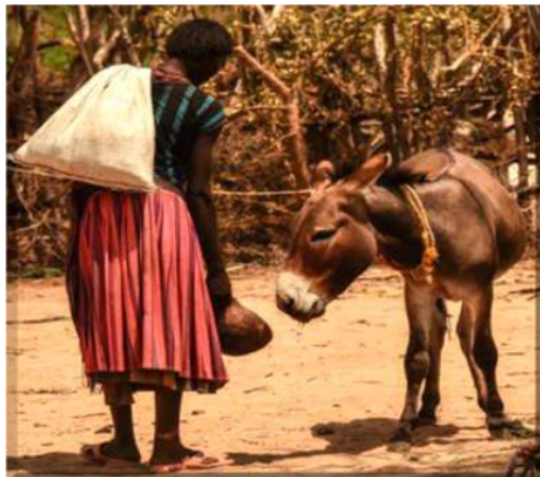
Pictured: Most towns and villages rely on donkey or ox and cart for transport

When pregnant women in Nigeria need to get to hospital to have their babies, most people have no transport. They rely on neighbours, who may have a car or even a motorbike. So, a woman called Halima, living in the village of Bardo, called a meeting. She said, 'Women in the village are a team and we make sure issues that affect us are resolved.' They decided to put funds together to buy an emergency vehicle to transport women to hospital quickly when they are about to have their babies. They named the vehicle 'Haihuwa Lafiya', which means 'safe motherhood'. Families pay a small amount of money to use it. The driver, Yunusa Mohammed, drives his emergency 'ambulance' very carefully. He said, 'I always make sure that I keep calm when I drive. I do this job with a lot of pride. I see it as my duty.'