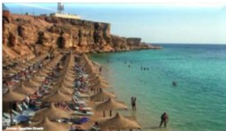
Pictured above: A popular beach resort in Sharm El-Sheikh

Sharm El-Sheikh is an Egyptian resort town between the Red Sea and the desert of the Sinai Peninsula. It is famous for year-round warm climate, clear waters and coral reefs. It is also world famous for its scuba diving due to the coral reefs there.