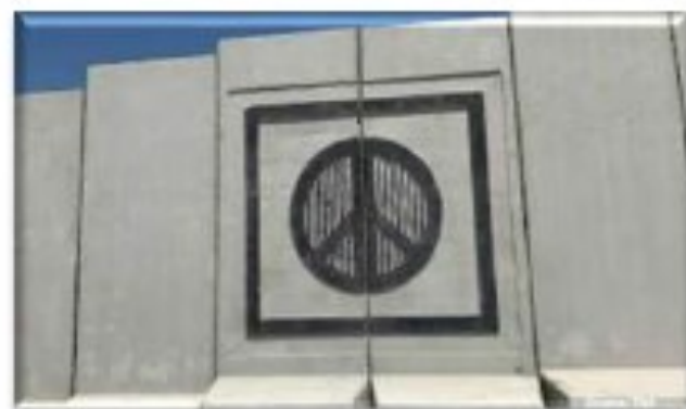
Pictured above: A section of the new wall around Sharm El-Sheikh showing a peace symbol.

The new wall has taken 3 years to build. It is 6m high, 37km long and made of concrete and wire. It's emblazoned with peace signs every 50m. Its aim is to ensure the safety of tourists, who will fly in and out through the local airport, and not to segregate the people living on the outside of the wall.