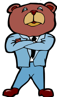
Father Bear is still very angry

upset this has caused their family, particularly Baby Bear who came off worst in the break in.