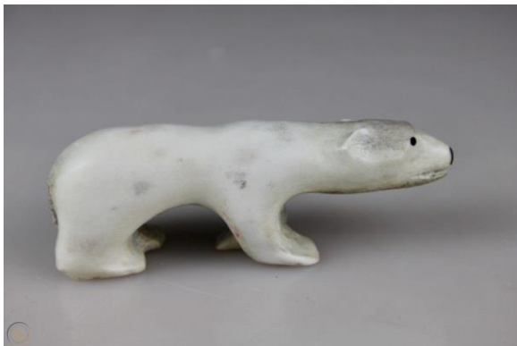
Polar bear carved in reindeer antler (unknown artist)

Polar bears inspired artists who live in the Arctic. People living in the Arctic would carve polar bears out of reindeer antler or walrus tusks. Your task is to make a 3D polar bear. You could use snow, carve it from soap (use a potato peeler and pencil or skewer), use modelling clay, papier maché...or use your own ideas.