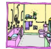
la salle de bain