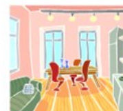
la salle à manger