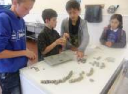
Counting the profits!