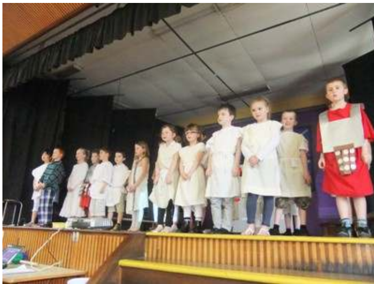
P3 Roman Play

Ancient Rome came to life at Dalbeattie Primary when the P3s performed their super play, all about life in the Roman Occupation.