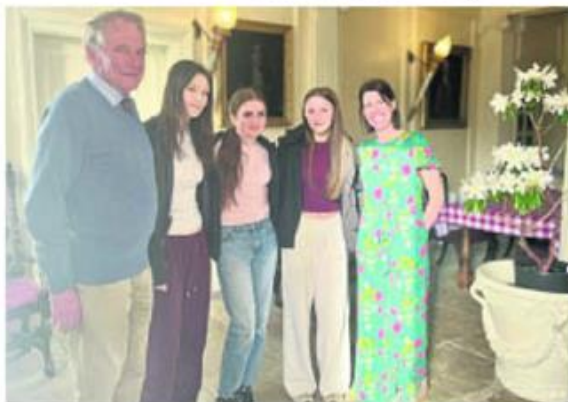
Pictured are members of the Brechin group, which won £3000 for donation to Re-engage.