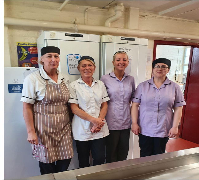
These are our very friendly Dinner Ladies, who we see each day at lunchtime in the Dinner Hall.