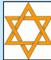
Judaism Star of David