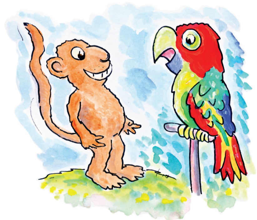
4 The right to ask for someone to repeat