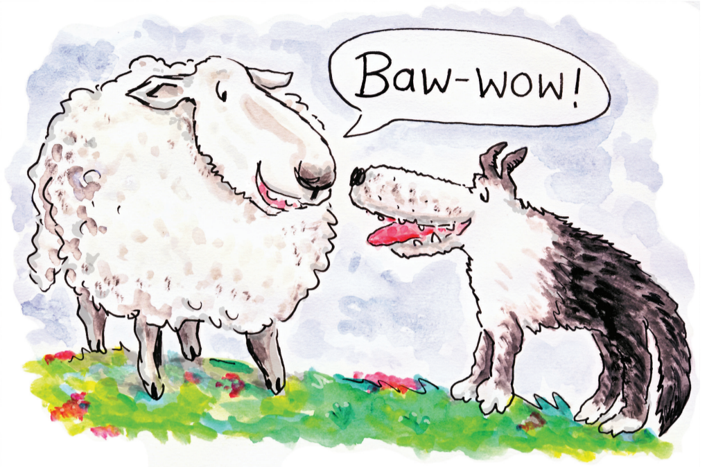
2 The right to make mistakes