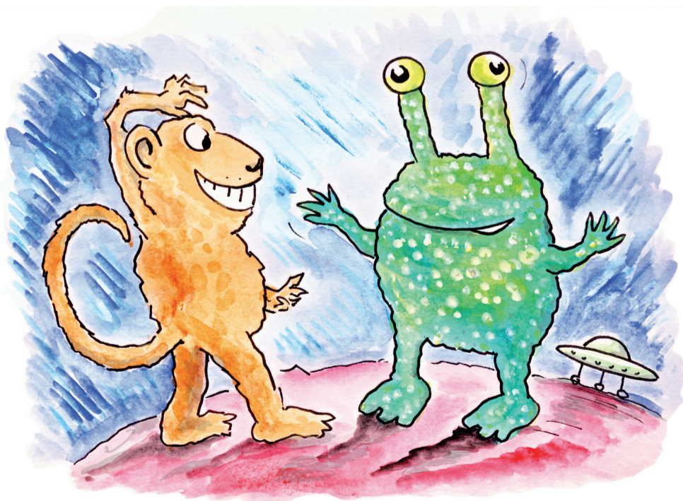
5 The right to make friends with someone who doesn't speak your language