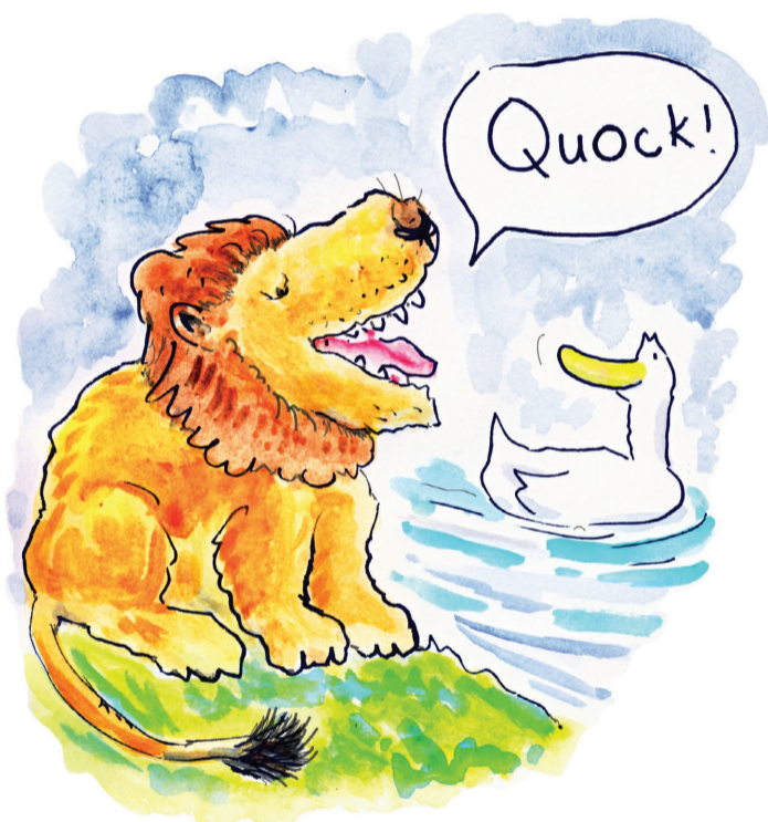
3 The right not to pronounce perfectly