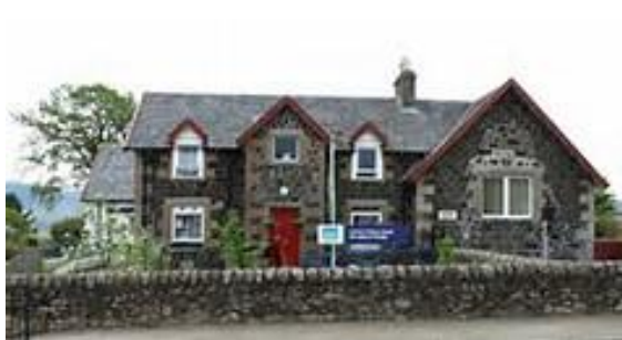
Furnace Primary School