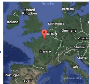
Ecole Primaire M. Petitpas