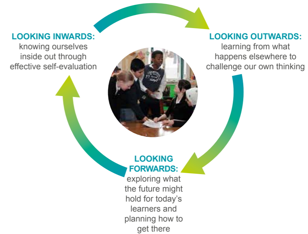
Fig. 2: Inwards, outwards, forwards

Through this approach, you will look inwards to analyse your work, look outwards to find out more about what is working well for others locally and nationally and look forwards to gauge what continuous improvement might look like in the longer term. How good is our school? is intended to support you and your partners in looking inwards to evaluate performance at every level and in using the information gathered to decide on what needs to be done to improve.