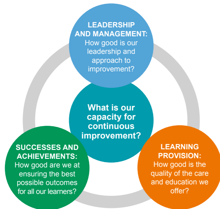
Fig. 6: How good are we now? How good can we be?

This diagram illustrates the strong relationship between each of the aspects and the central question about the school's capacity for improvement. A range of appropriate evidence of all three aspects is required to evaluate the school's overall performance. It is however possible to use a only a few of the quality indicators or even a cluster of themes across quality indicators to support self-evaluation related to very specific aspects of a school's life and work.