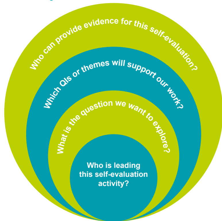
Fig. 5: Self-evaluation – taking a closer look

Some examples of how this might work in practice can be found in Appendix 1.