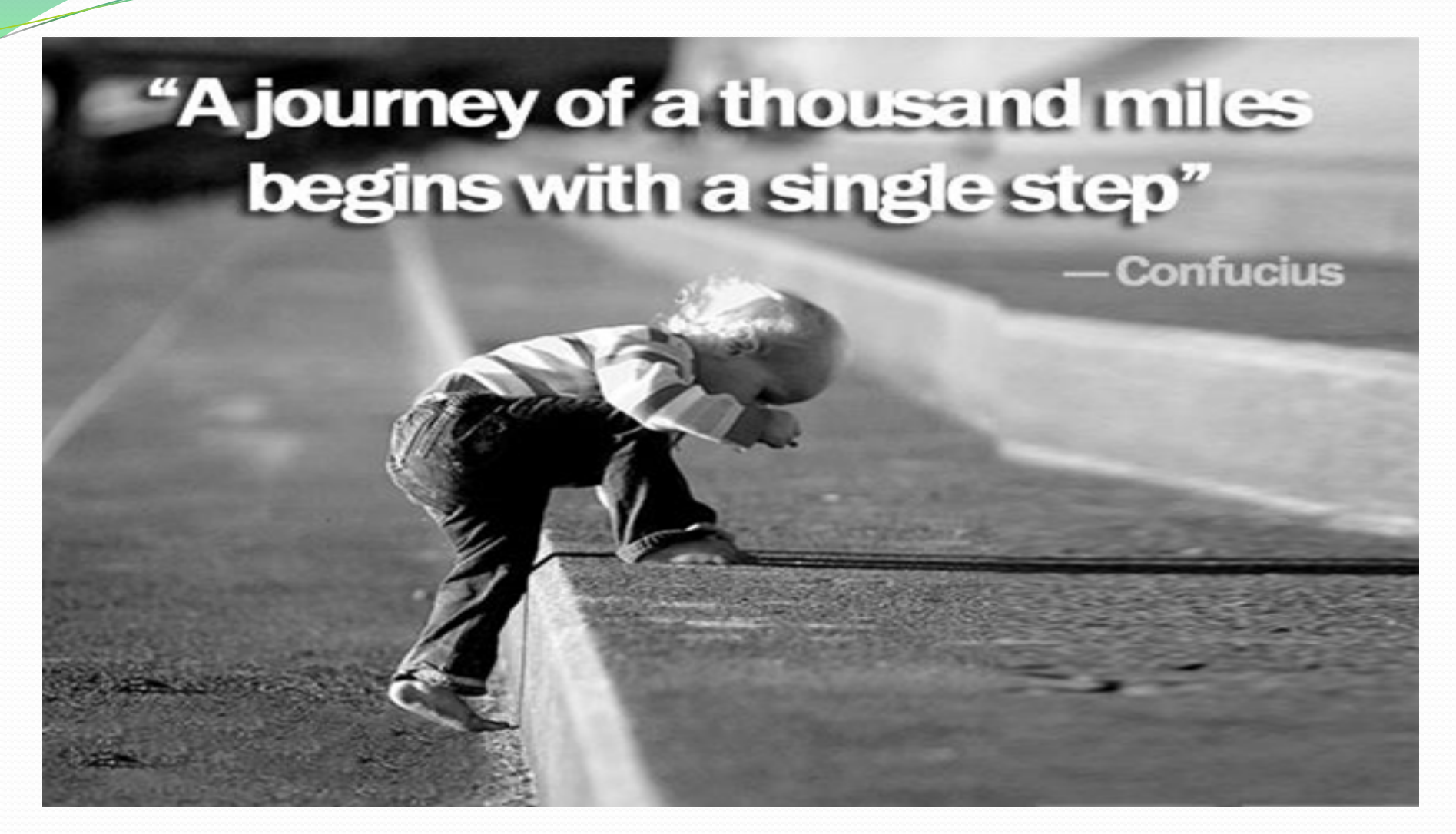
It's up to you!