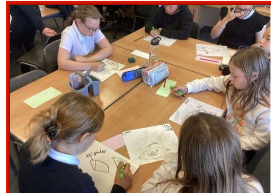
MATHS WEEK SCOTLAND